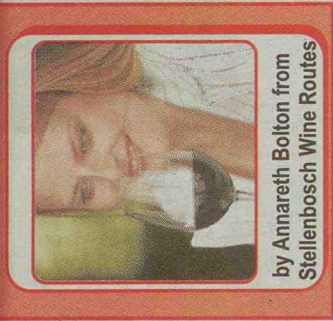
by Annareth Bolton from Stellenbosch Wine Routes

Its resilience to persecution notwithstanding, the leopard has suffered extensive range loss in the Cape and is now extinct in many areas of the province where it formerly occurred. The species is routinely and regularly removed from farms with little knowledge of population or genetic status, whether removals are sustainable or whether the factors giving rise to conflict are established.